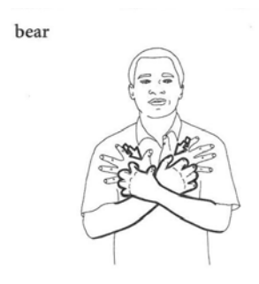
Figure 2: A drawn depiction of the sign BEAR in ASL (Valli 2005: 38).

Each of these systems has sets of symbols for the various values of sign parameters, and these symbols are combined to represent the form of the sign. The Stokoe and HamNoSys notations are mostly linear and rather abstract, but the SignWriting version is more holistic and the signs are more easily recognizable from the notation. An example can be seen using the sign for BEAR in ASL,<sup>3</sup> first depicted as a line drawing in Figure 2 and then transcribed in the three main notation systems in Figure 3.